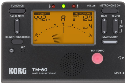
Korg TM-60 Combo Tuner Metronome