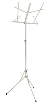
Folding Wire Music Stand for Home Practice