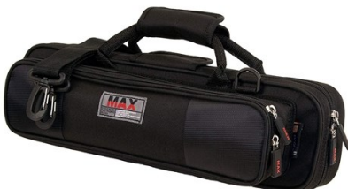
Pro-Tec MX308 Flute Case– Max

You are welcome to explore all your options in getting an instrument