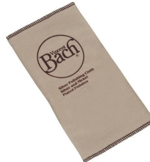
Silver Polishing Cloth for Sterling and Nickel Plated Instruments