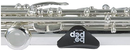
Bo-Pep Thumb Guide