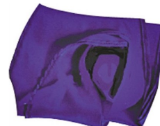
GEM Swabs Silk Flute Swab