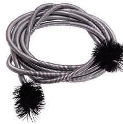
Wire Flexible Cleaner (snake brush)