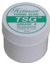
One Jar of Hetman #8 Tuning Slide Grease