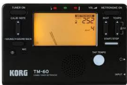
KORG TM-60 Tuner/Metronome

Mouthpiece provided by the school in beginning band. Students will purchase their own mouthpiece in 7 th grade.