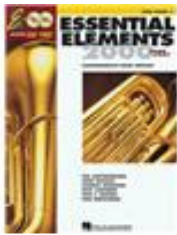
Hal Leonard Essential Elements 2000 Book 1 plus DVD for TUBA (Not for euphonium)

You will need to obtain these items from a music store: