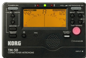
Korg TM50 Tuner and Metronome