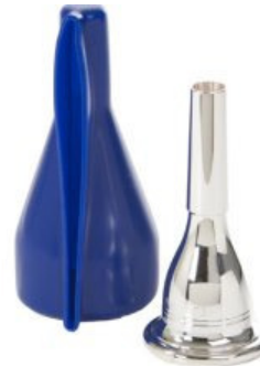
Tuba Mouthpiece Conn Helleberg 120S Must be purchased prior to the start of school.