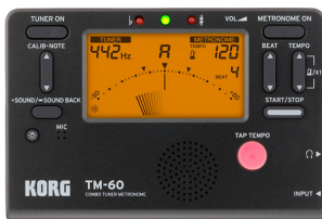
Korg TM60 Tuner and Metronome