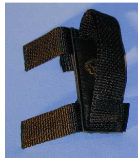
French Horn Strap $23.00-$26.00 Order online: (not available in local music stores)

Google: "Leather Specialties Horn Holding Strap" Poperepair.com or Houghtonhorns.com