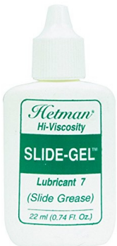
One Bottle of Hetman #7 Tuning Slide Gel